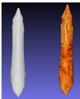
Figure 2: 3D model of a decorated harpoon (PWNHC 982.50.362). Left: Model without texture. Right: Model with texture created using Zbrush.