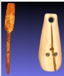
Figure 3: 3D models created with 3D3 White Light scanner. Left: Awl made from bone (PWNHC 982.50.154). Right: Fishing lure carved from a polar bear tooth (PWNHC 982.44.003).